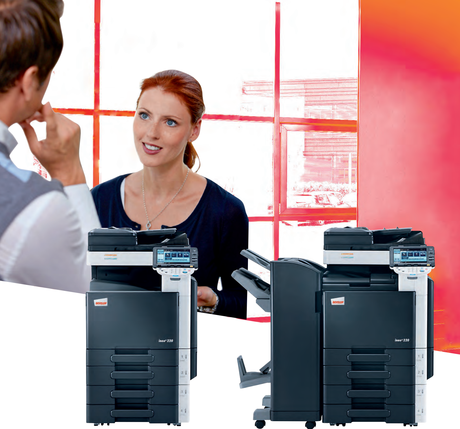
ineo+ 220 with document feeder (DF-617) and 2x 500 sheets universal tray (PC-207)