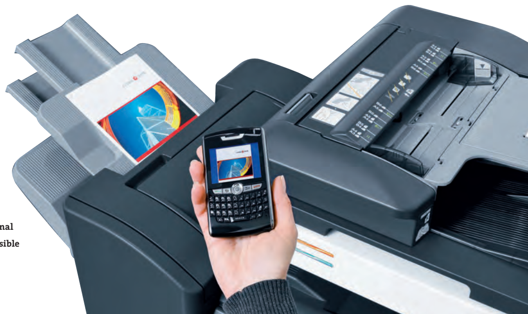
Mobile printing via optional bluetooth connection possible