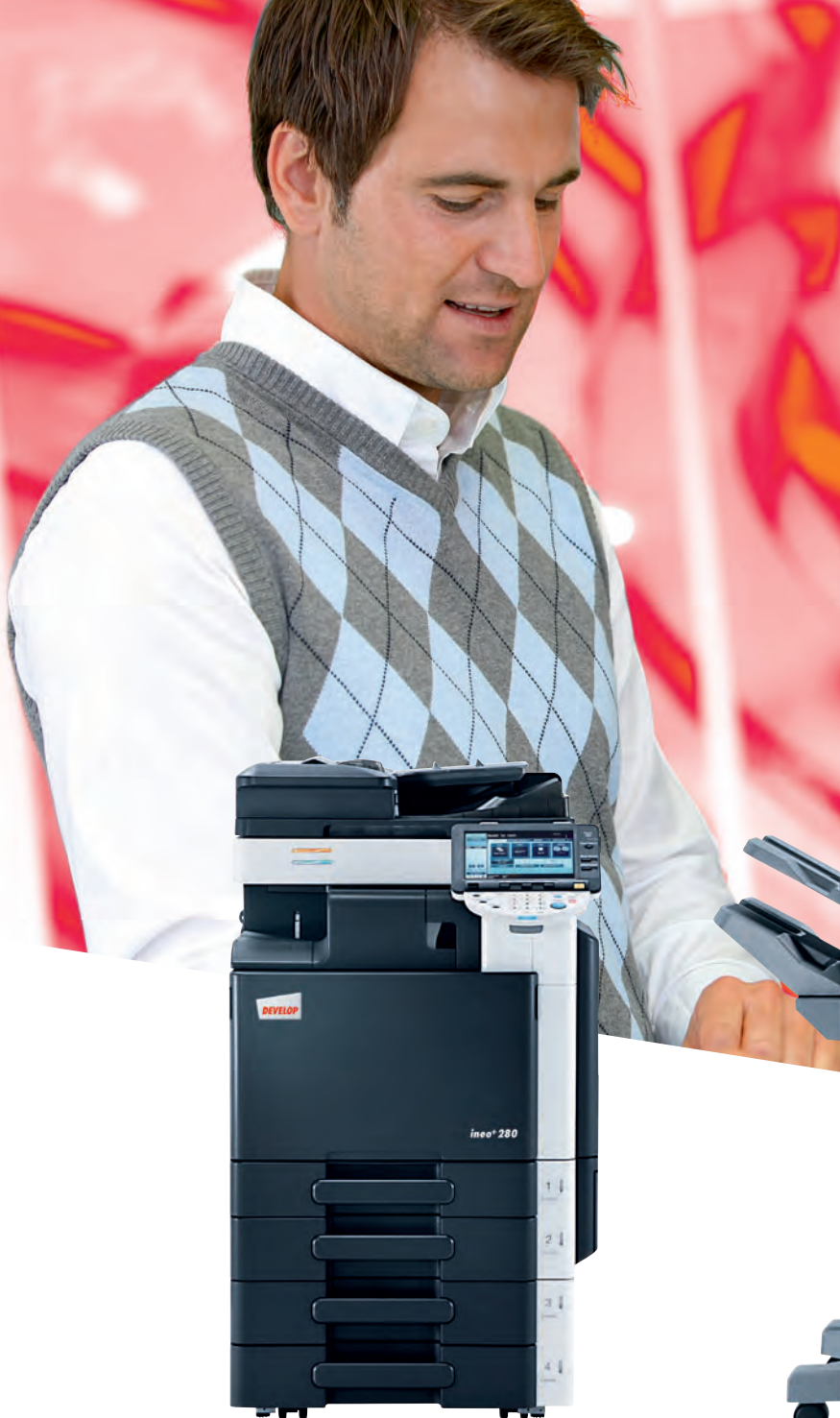
ineo+ 280 with document feeder (DF-617), inner finisher (FS-529) and 2 x 500 sheets universal tray (PC-207)