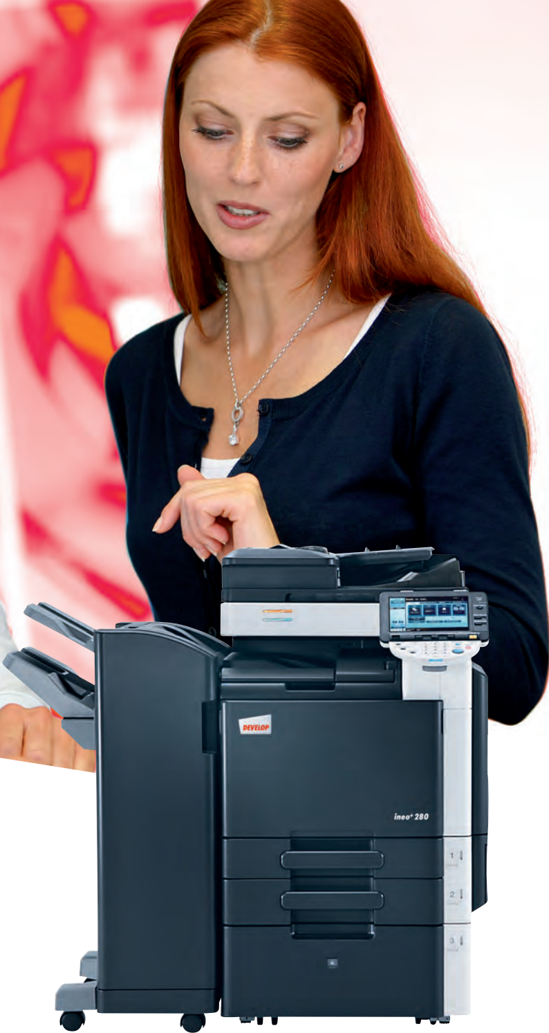
ineo+ 280 with document feeder (DF-617), floortype finisher (FS-527) and large capacity tray (PC-408)