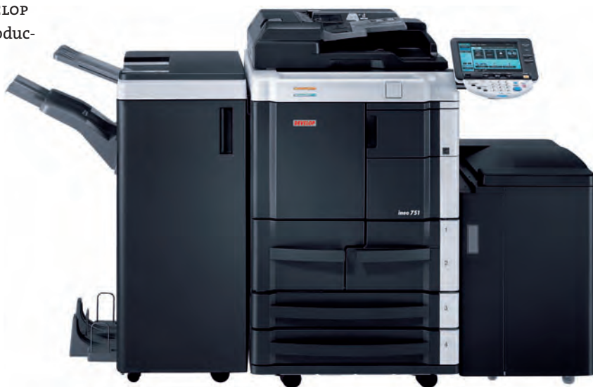
ineo 751 with booklet finisher FS-610, and the large capacity tray LU-405